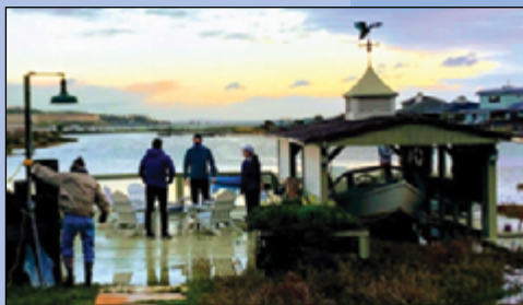
Art: Adaptation International

One step offered is to mandate disclosure of the risk when property changes hands. Another is to place a Floodplain Frontline Zone on the most threatened areas, discouraging further improvements. A Floodplain Accommodation Zone at slightly higher elevation would allow building with safeguards. Gently, gently. This process will take time. JH