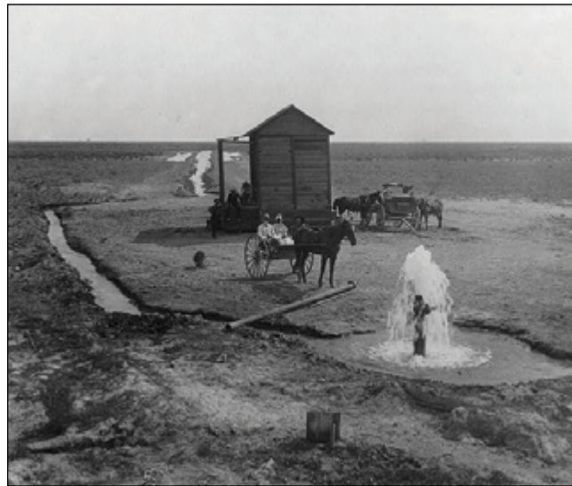
Kern County well circa 1890.

Critical to the competitiveness of California’s farmers with industrialized agriculture elsewhere in the nation was the irrigating farmer’s access to a cheap and self-replacing immigrant workforce. “They kept those laborers firmly under control decade after decade,” writes Worster. “California’s polyglot, wage-based version of the Egyptian corvées [unpaid labor].”