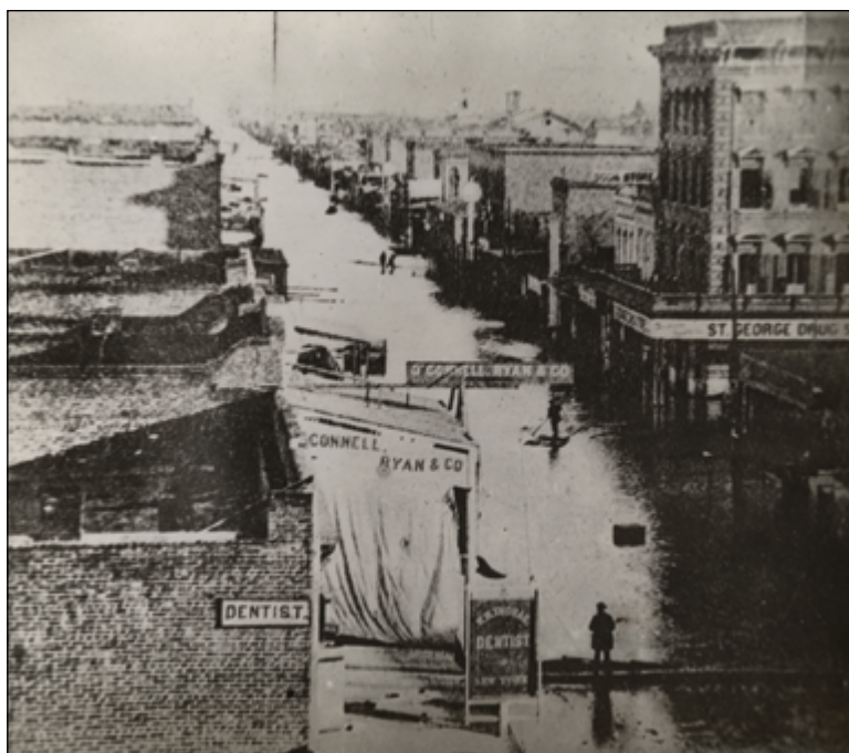
Flood of 1861-62 in Sacramento.

collapsed freeways. "This made the economic case for Measure AA," Covert says. "You can do a lot to decrease the risk for $500 million." Measure AA, which Bay Area voters passed in 2016, will raise half a billion dollars over 20 years to restore the tidal marshes that protect against flooding.