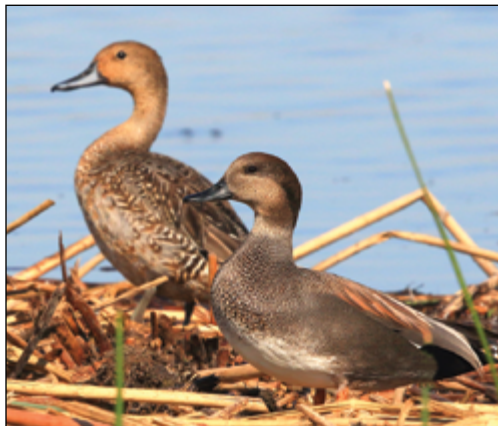
Gadwall.