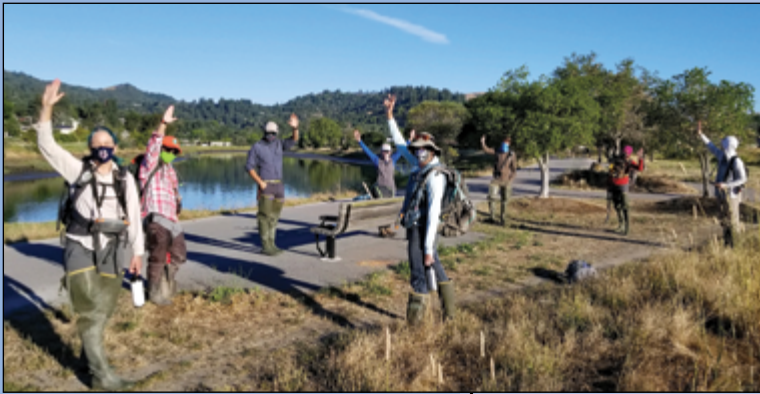
ISP staff raise their hands to affirm they completed the daily Covid safety checklist before coming to Marin's Creekside Park.