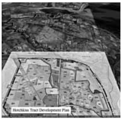
Bob Twiss and CALFED

The Hotchkiss Tract is in an unincorporated area, on which 544 homes already stand, either behind or on top of a 100-year-old levee along the Sacramento-San Joaquin River Delta. These residents use East Cypress Road—the area's only road—to get in and out of the tract, and all traf-