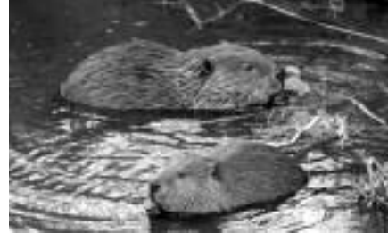
Beavers in Alhambra Creek, downtown Martinez.