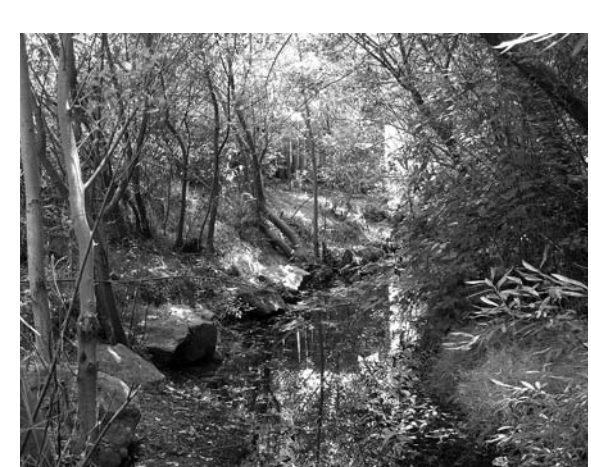
An urban stream restoration project in Richmond.

Conservation, restoration, and environmental research projects all over California are suffering major collateral damage from the Sacramento budget wars. On December 17, the state issued a stop-work order on all projects funded by bonds from such voterapproved measures as Propositions 13,