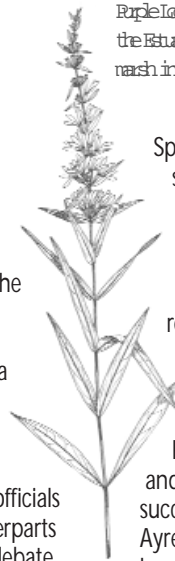
Purple Loosestrife, Lythrum salicaria , on the Estuary Watchlist for freshwater marsh invaders.

Clearly, smooth cordgrass' propensity for choking out creeks makes it detrimental to the clapper rail. But the tough, ubiquitous grass also provides cover for the endangered bird. The relationship between clapper rails and Spartina — whether native or introduced — is complex. The equation is not simply that the more native Spartina foliosa you have, the more clapper rails you will have, but a question of where and how Spartina is growing and what else is in the immediate vicinity. For example, slump blocks of